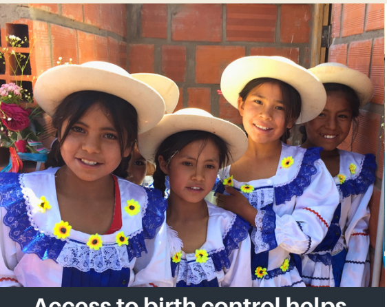
Access to birth control helps keeps young women in school