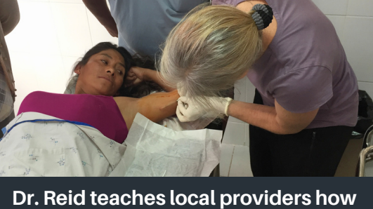
to insert birth control implants

GMEF partners with rural health centers by providing birth control supplies and training providers in their use.